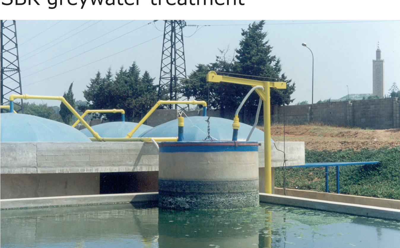
Research - Demonstration installations at partner institutions, here IAV Hassan II