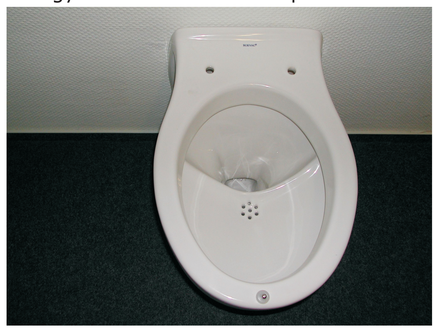
Integrated approach for reuse - urine separation toilet as example for a good practice