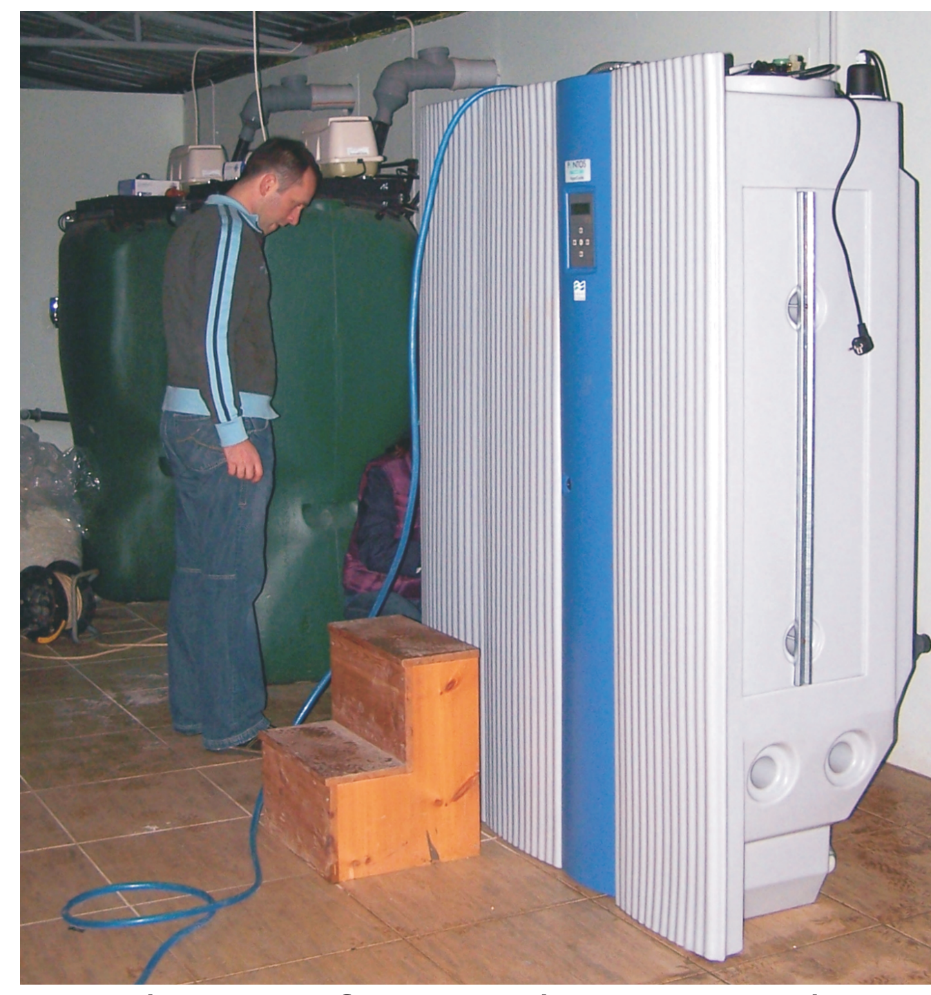
Introduction of new techniques - Inhouse SBR greywater treatment