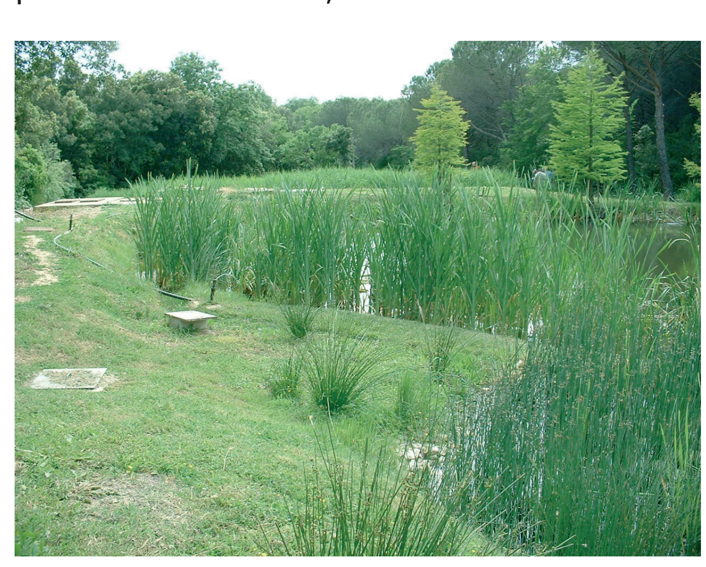
Appropriate techniques - Constructed wetland in Italy, a treatment with low energy and maintenance requirements